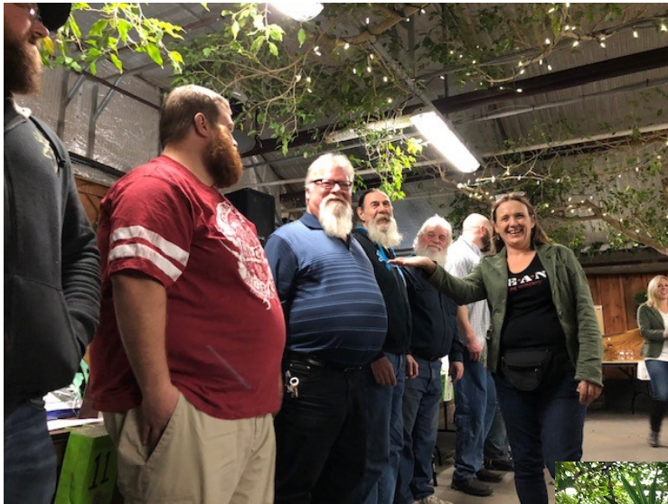
2019 Game Dinner Best Beard Contest Participants