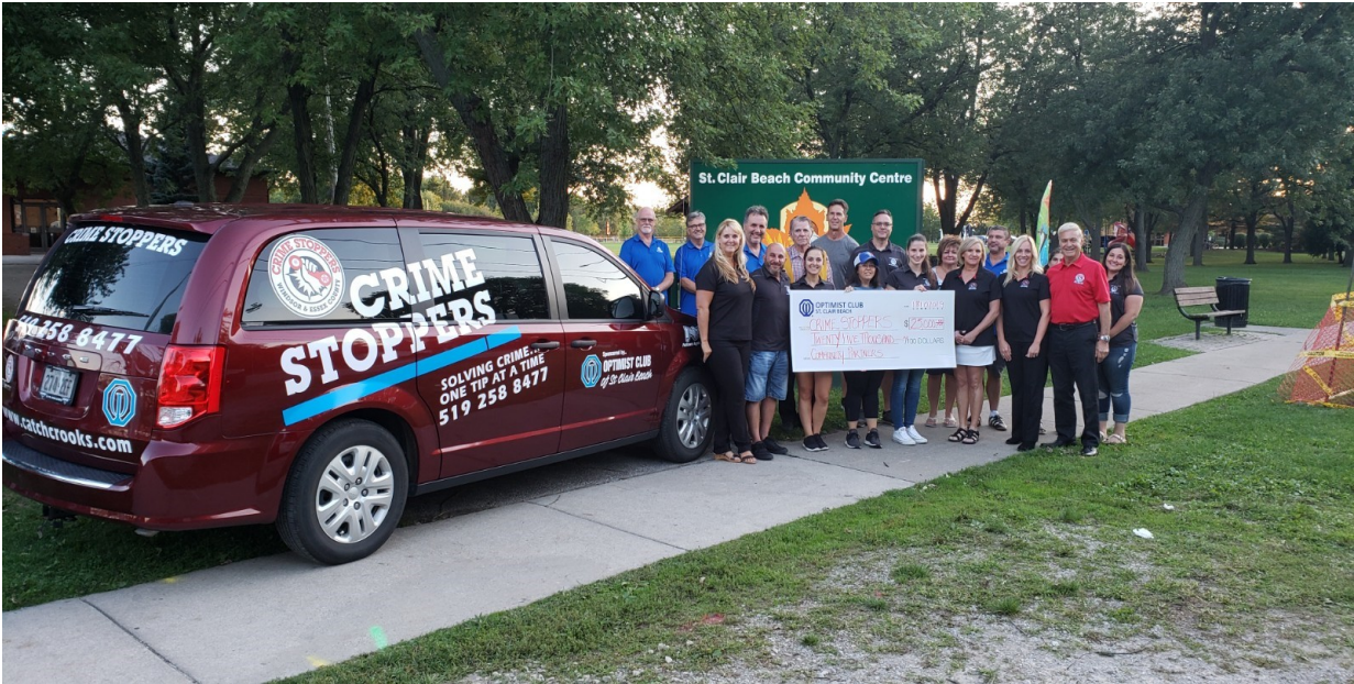
On 9/18/19 Crime Stoppers attended the cheque presentation for our van at the Optimist Club. Thank you to the Saint Clair Beach Optimist Club for their generous support for the Windsor and Essex County Crime Stoppers. program