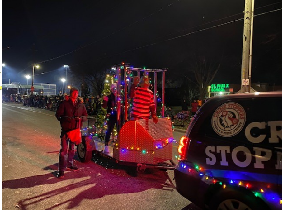
Crime Stoppers Christmas Parade participants