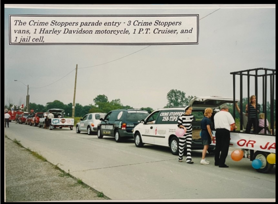
The Crime Stoppers parade entry - 3 Crime Stoppers vans, 1 Harley Davidson motorcycle, 1 P.T. Cruiser, and 1 jail cell.

A look back at the Tecumseh Corn Fest Parade in August 2000